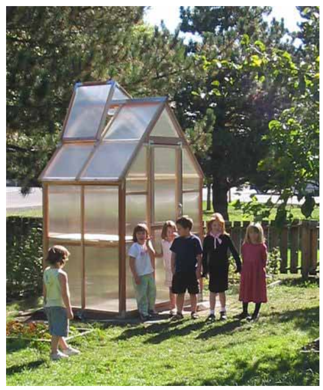
Wow, look at the new greenhouse!

Mortensens refinished our picnic tables! Thank you all very much.