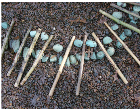
A detail of a "nest" built by a group of children using our supply of bamboo and rocks

unlucky soul darkening their doorstep, the father of the household often leaves just after midnight and re-enters the home to make sure he is the first visitor of the New Year. There are firecrackers and enormous dragon puppets parading through the streets and it is very lucky indeed to have the dragon stop and dance in front of your home. Everyone in Vietnam turns a year older on Tet as that is when all birthdays are commemorated.