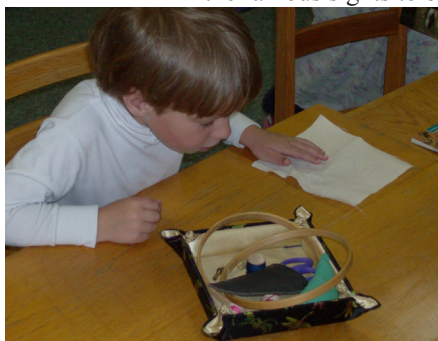
What happened, Mica?!