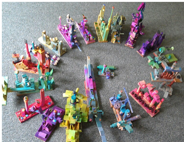
Zany, wild and beautiful wood sculptures.