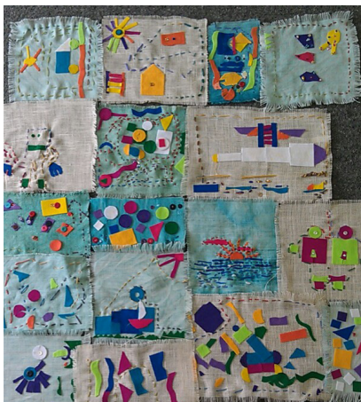
Burlap and felt sewing creations.