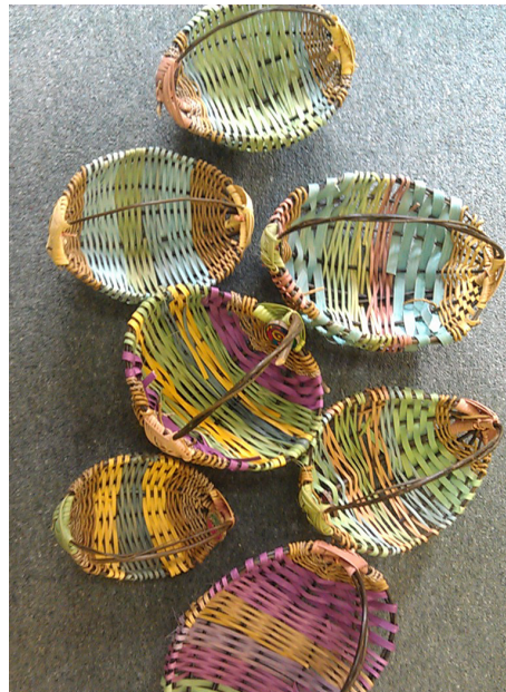
Baskets from Friday artclass