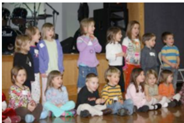
Singing in our best voices at the auction

I would like to end with a big thank you to everyone who participated in our Auction, including our children. They prepared items for sale, made decorations and sang their little hearts out. I thought they were adorable!