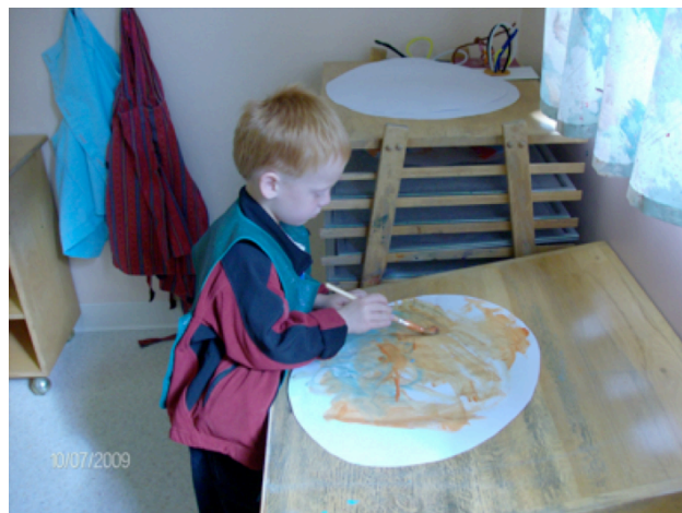
Hayden paints with orange

also been enjoying the art activities that Leslie has created such as mask-making and a gold collage that puts us in mind of the great mineral wealth that Nigeria possesses.