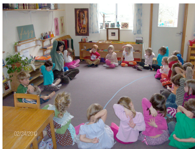
A nice stretch during group time