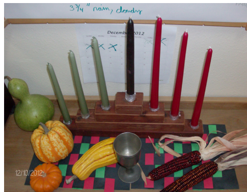
Our kinara for Kwanzaa.

by and ask your neighbor if they or their dog would like to accompany you. Maybe there's a neighborhood child who would like to join you. Even if no one is home or the answer is "no, thank you," at least you asked! If you don't get to walk the dog, now everyone's hands are free to pick up litter. That is a gift for the whole neighborhood! Take a couple of plastic grocery bags and be sure to wash your hands once you get home. You can make treats for the area's wild bird population.