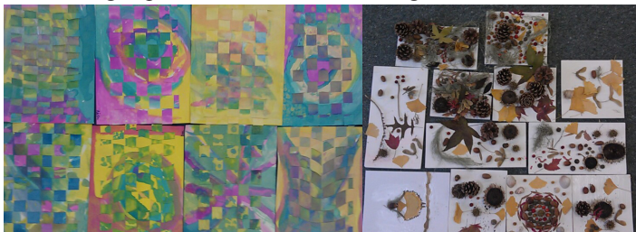
Watercolor paper weaving

Our Fridays continue to take some interesting turns as unexpected possibilities keep coming up. As the year began and the children were working on rectangular yarn weavings, we also began painted water color weavings and then water