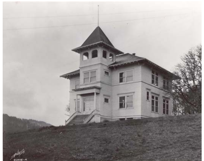
The old College of Philomath building in its original glory. Our projected new site!

Check out Upcoming Events about the Day of Caring and our new site!